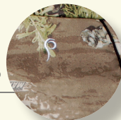
Realtree Advantage Max-1 HD®