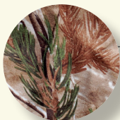
Realtree AP HD®